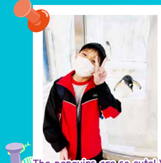
The penguins are so cute! We all love taking photos with them.