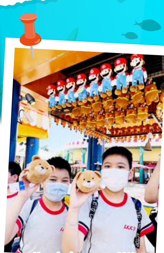
How lucky we are! We won the game and got a prize!