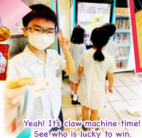
Yeah! It's claw machine time! See who is lucky to win.