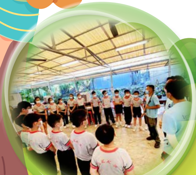
We listened to the instructions very carefully.