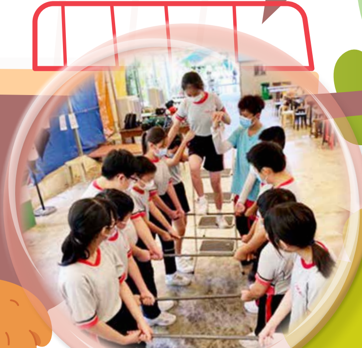
Teachers and students are practising walking on the rope ladder.