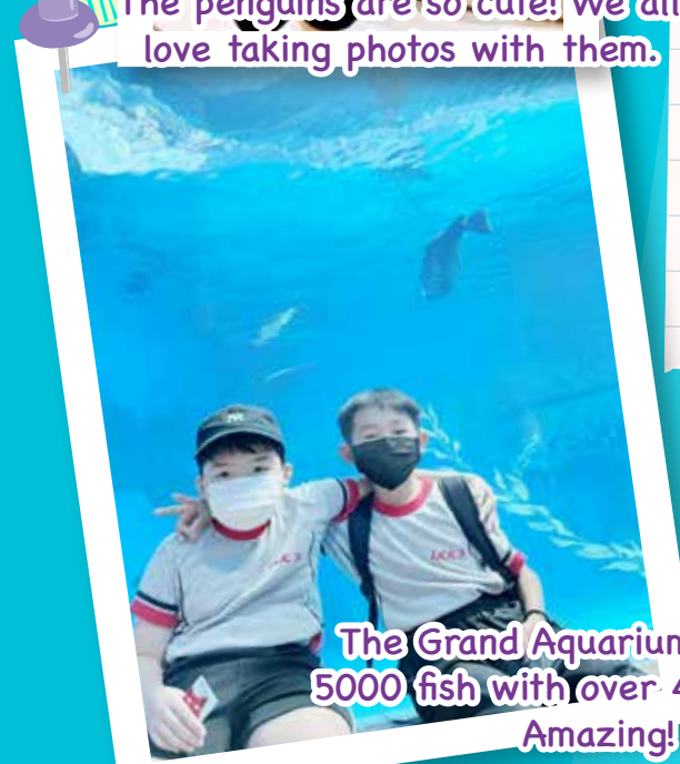
The Grand Aquarium has over 5000 fish with over 400 species! Amazing!