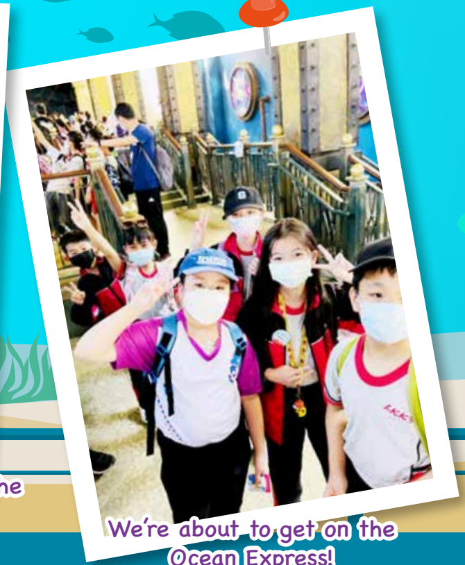
We're about to get on the Ocean Express!