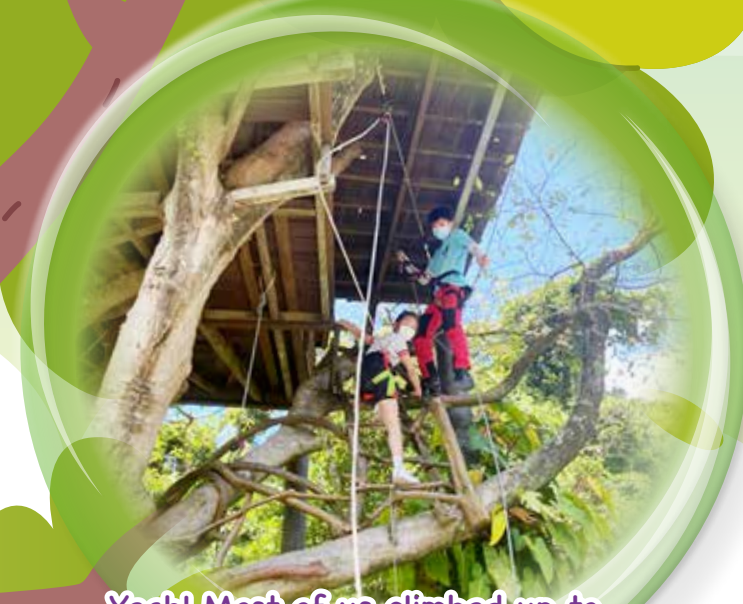
Yeah! Most of us climbed up to the tree house successfully! How brave are we!