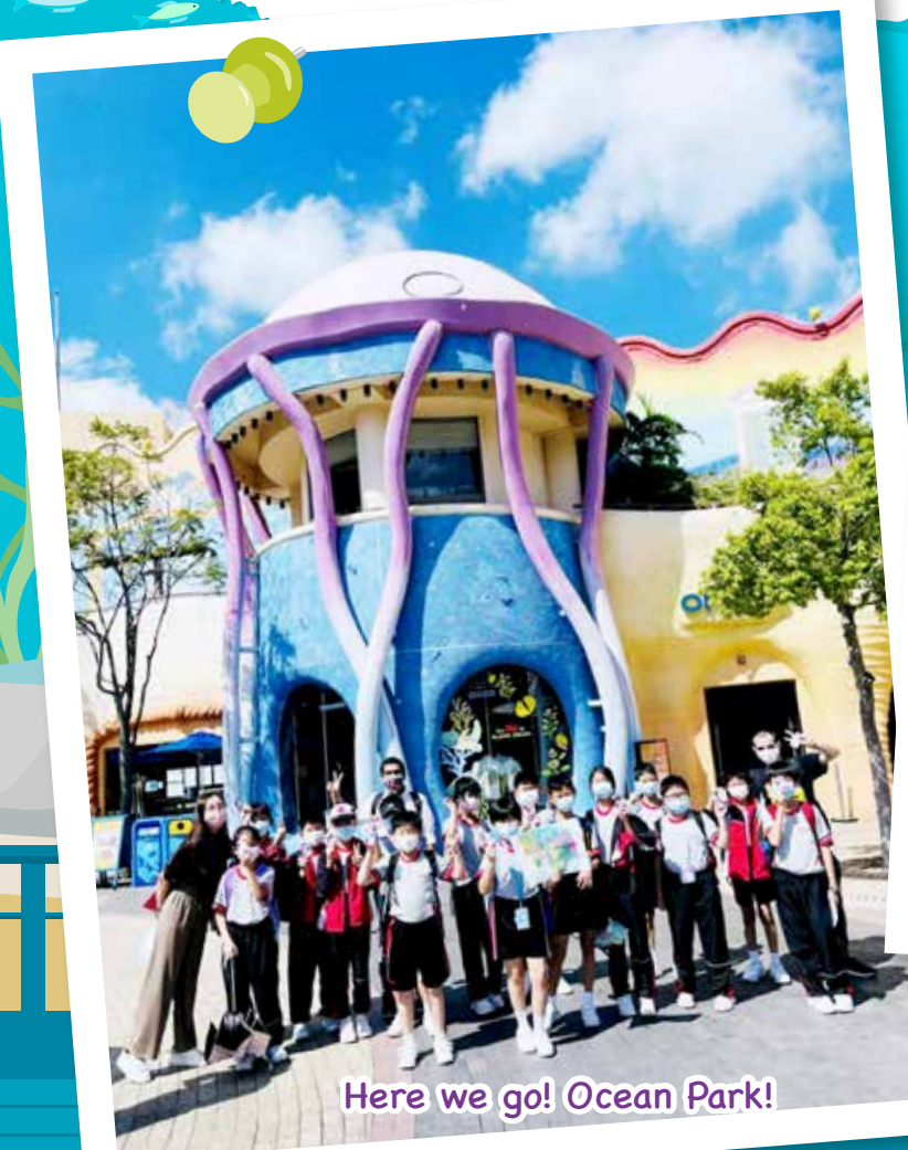
Here we go! Ocean Park!