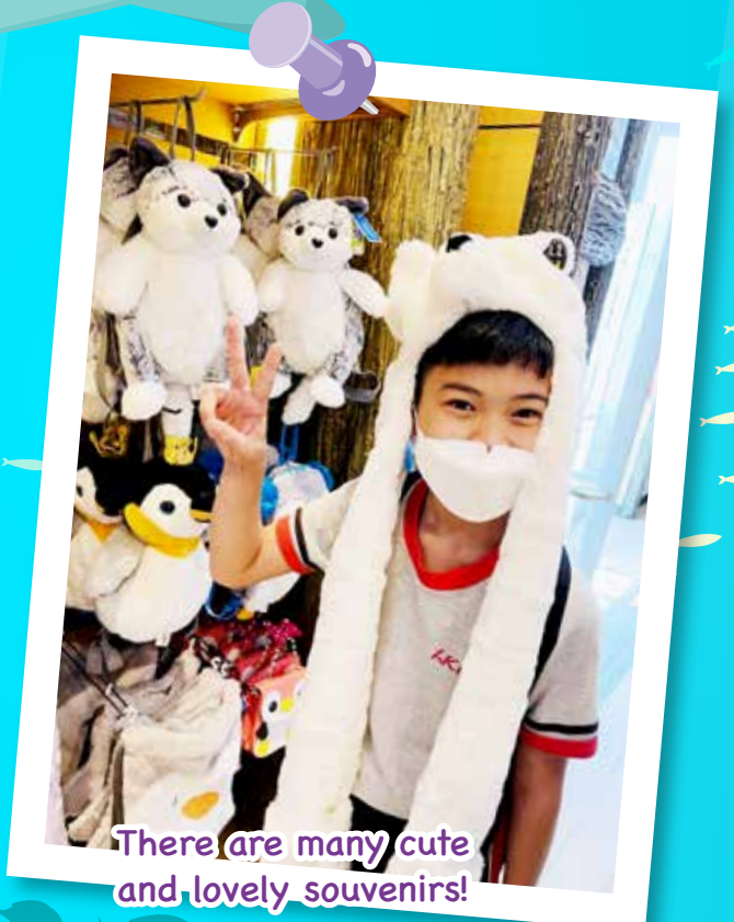
There are many cute and lovely souvenirs!

It was a happy day. I had a good time with my friends. I will never forget this wonderful day.