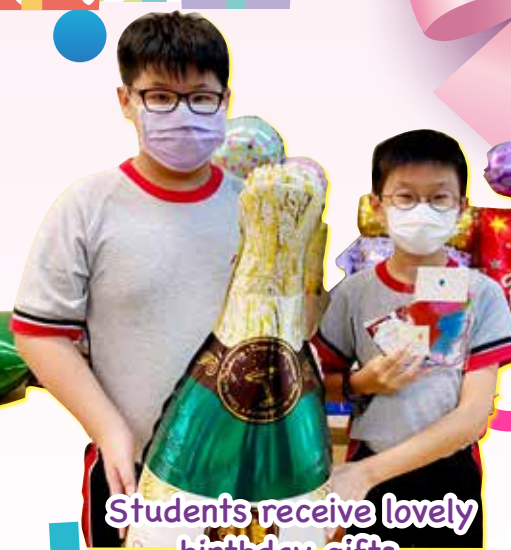
Students receive lovely birthday gifts.